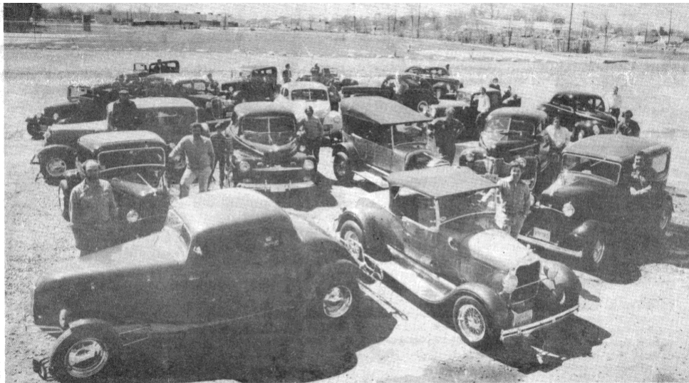
'77 NJSRA MEETING ON RT. 46 IN THE BACKGROUND IS NOW THE WILLOWBROOK MALL